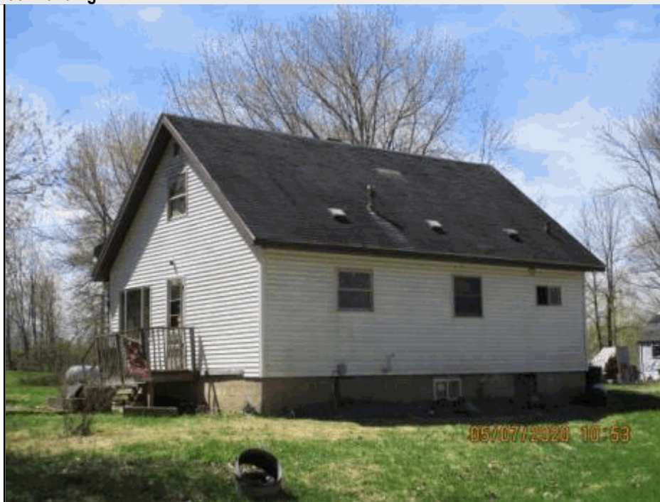
Total living area is 1,152 SF; building assessed value is $57,100